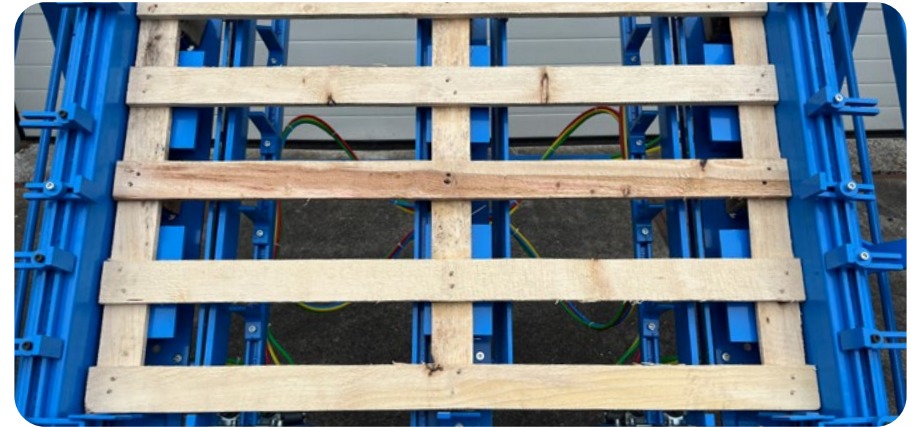
Pallet in Expert